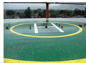
Approved helicopter landing area

It is suggested that all helicopter markings follow the International Chamber of Shipping Guidelines and are not left to the imagination of ships' staff.