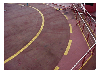
Boundary of non-slip paint

Below: markings that are not considered normal or acceptable