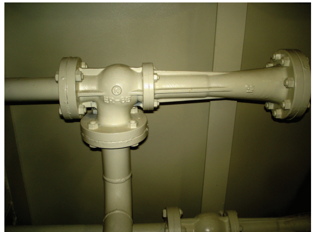
Typical small eductor

Sea water used to drive the hold cleaning eductor is normally taken from the deck wash line. At the point where the branch line carrying the drive water for the hold eductor leaves the deck wash line, two valves with spectacle flanges and a spool piece are usually fitted. These spectacle flanges prevent accidental hold flooding when the deck line is pressurised.