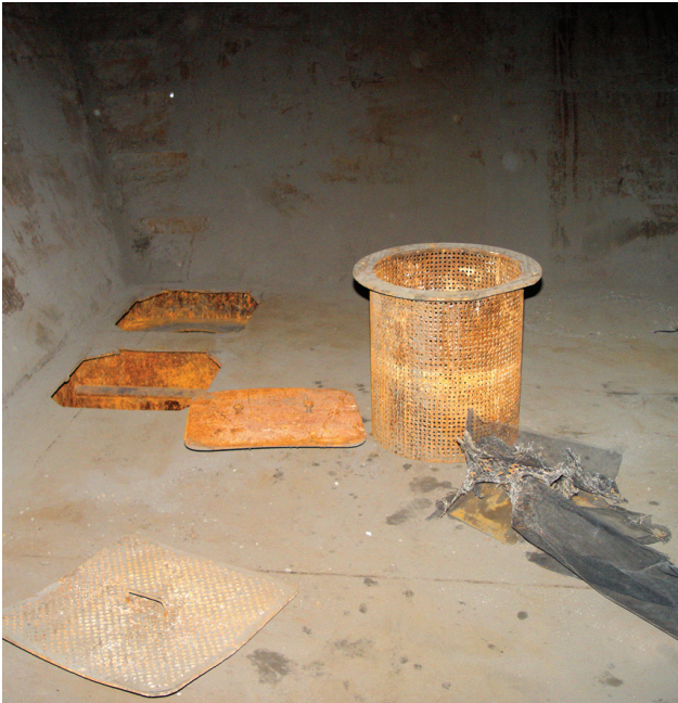
Hold suction filters

To check that the bilge suction and bilge suction line are clear and working correctly, a nominal amount of clean water should be poured into the bilge well and pumped out.