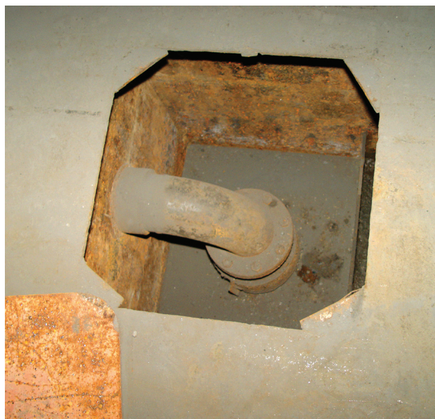
Hold suction arrangement

The bilge suction line in the hold bilge is normally fitted with a perforated strum box which prevents cargo debris from entering the bilge line. The strum box should be thoroughly cleaned after each cargo discharge and if possible, dismantled and checked for damage or corrosion. The end of the bilge suction line must be confirmed as clear, with no debris fouling the end of the suction pipe.