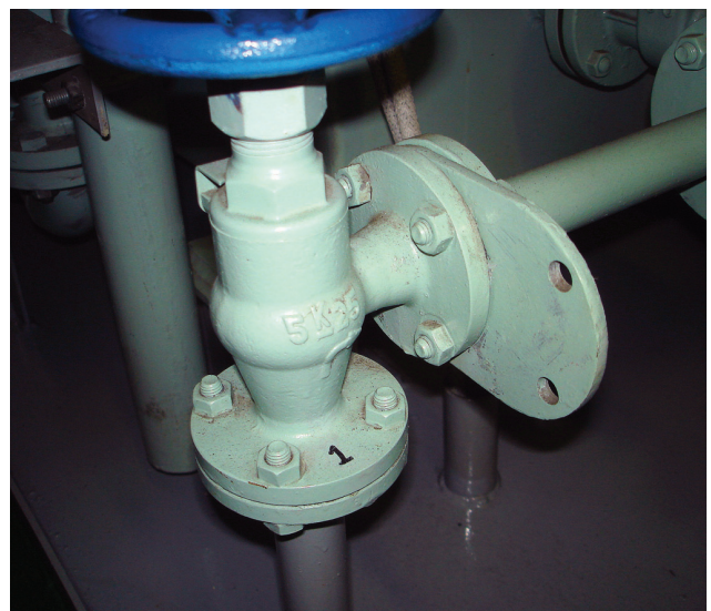
Spectacle blank in open position

It is most important that when the hold cleaning eductor system is not in use, the spectacle flanges must be turned so that the blank spool piece is in the closed position to prevent water flooding back into the cargo hold cleaning line.