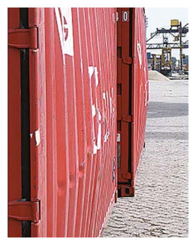
Figure 34.2: Bulging flexitanks.

A large number of claims have arisen relating to containers carrying flexitanks, where the pressure placed on the sidewall panels inside the containers has resulted in them bulging beyond accepted ISO external dimensions and tolerances, leading to permanent deformation. The International Organization for Standardization (ISO)/ Institute of International Container Lessors (IICL) deformation limit for sidewall panels is a maximum of 10 mm beyond the plane of the side surfaces of the corner casting fittings. This limit has been exceeded in many incidents, so some operators have imposed limits on the quantity of liquid that may be carried in a flexitank.