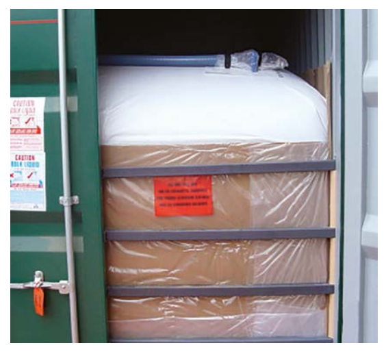
Figure 34.5: Use of protective cardboard sheets.

To ensure that a flexitank does not bulge through the gaps in a steel framework bulkhead, a sufficiently rigid sheet should be placed on the inside of the bulkhead. This prevents the flexitank chafing against the steelwork. Figure 34.5 shows horizontal steel bars used with cardboard sheeting placed between the flexitank and the steel bars.