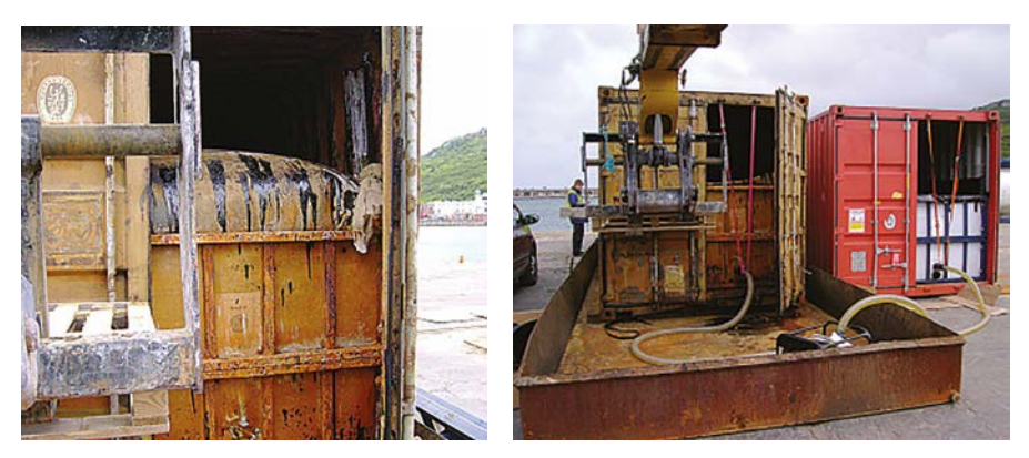
Figure 34.7: Flood-damaged flexitanks containing undamaged latex.

A flexitank can sustain severe trauma without leaking. Figure 34.7 shows a flexitank full of synthetic latex stowed at the bottom of a flooded hold. There was no leakage and the product was later sampled, approved and discharged for its intended use.