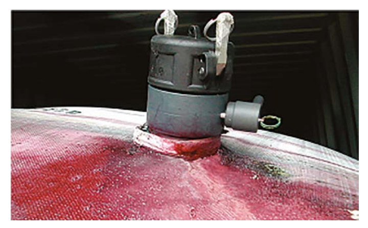
Figure 34.6: Flexitank valve.

For ease of discharge, bottom fittings adjacent to the doorway are generally preferred. However, this can result in a static head of pressure between the flexible body of the tank and the valve construction. Leaks can occur due to the detachment of the double patch around the valve opening of either the top or bottom fittings.