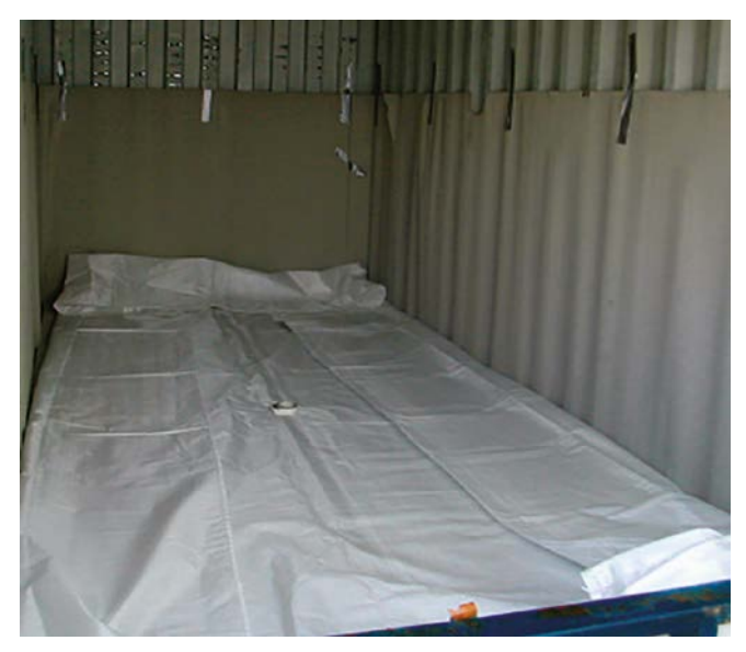
Figure 34.4: Use of kraft paper.

To protect the flexitank from abrasion against bare metal, the normal practice is to line the inside of the container. Materials often used include corrugated cardboard, Styrofoam sheets and kraft paper.