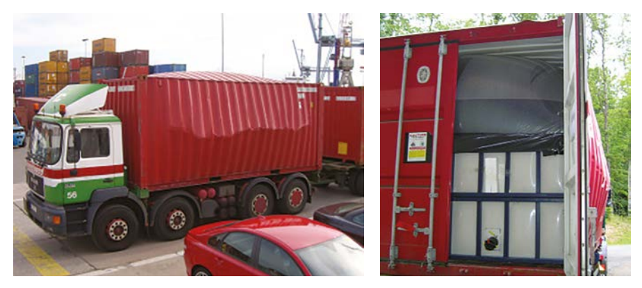
Figure 34.8: Damage caused by fermentation of wine.

However, problems do arise, such as with wine which expands excessively if it ferments in a flexitank, see Figure 34.8.