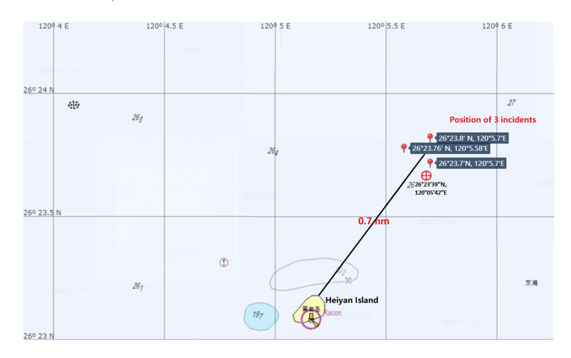
Positions of 3 grounding incidents from 2020 to 2022

The identity of those underwater objects are currently unknown and they are not shown in the present public nautical chart.