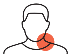
SWOLLEN LYMPH NODES