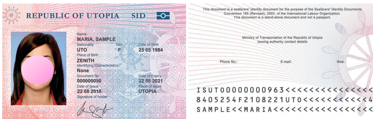
Picture 1: Front and reverse side of a TD1-size specimen of C185 seafarers' identity document (SID) in card format.

Therefore, only SIDs issued in the format provided for by ILO C185 are legally valid in Brazil as a travel document to exempt working seafarers from the need to obtain a visa, regardless of their nationality and for cumulative stays of up to 180 days per migratory year. [Sections 2.6 & 3.3]